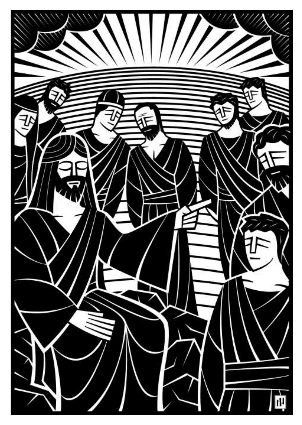
St. Paul Lutheran Church Fourth Sunday after Pentecost- July 3, 2022