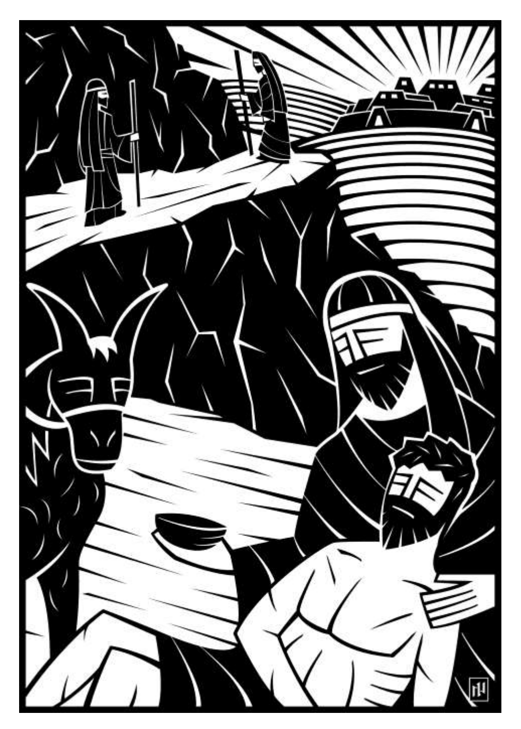
St. Paul Lutheran Church Fifth Sunday after Pentecost- July 10, 2022